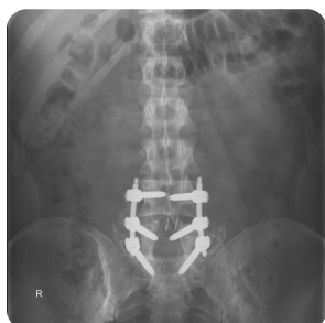
to multiple spinal reconstructive surgeries...