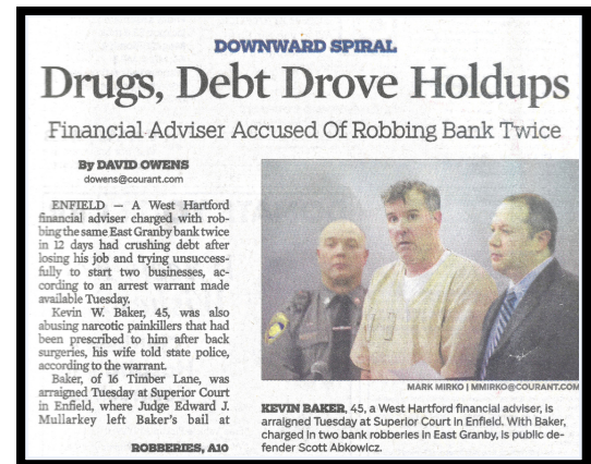
Hartford Courant, Front Page; 2-14-2016