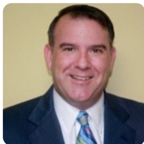
From a Country Club lifestyle as a top producing V.P. in Financial Services...