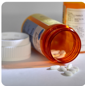
to opiate addiction; failed business ventures; financial ruin; suicidal ideations...